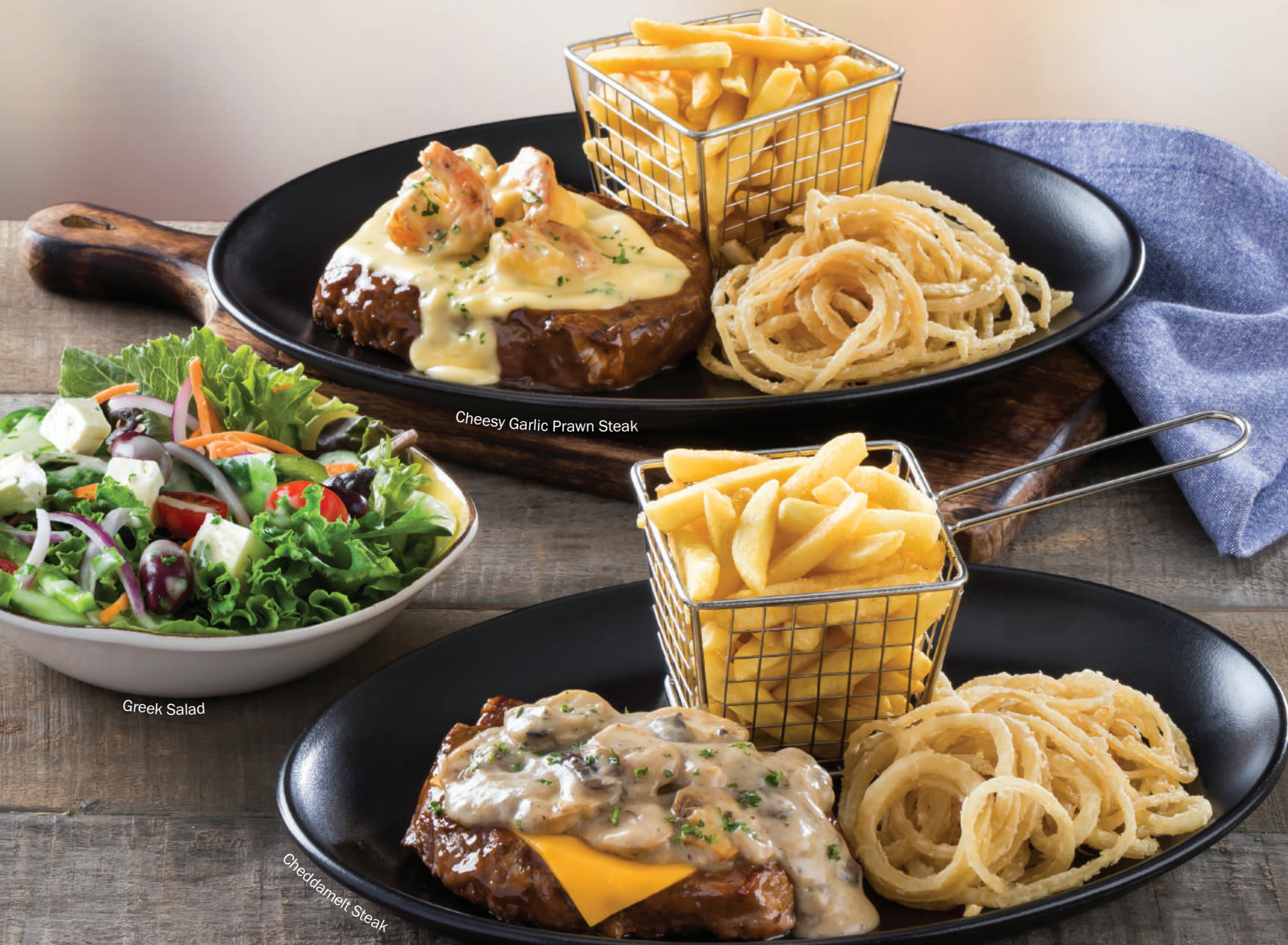
Cheesy Garlic Prawn Steak