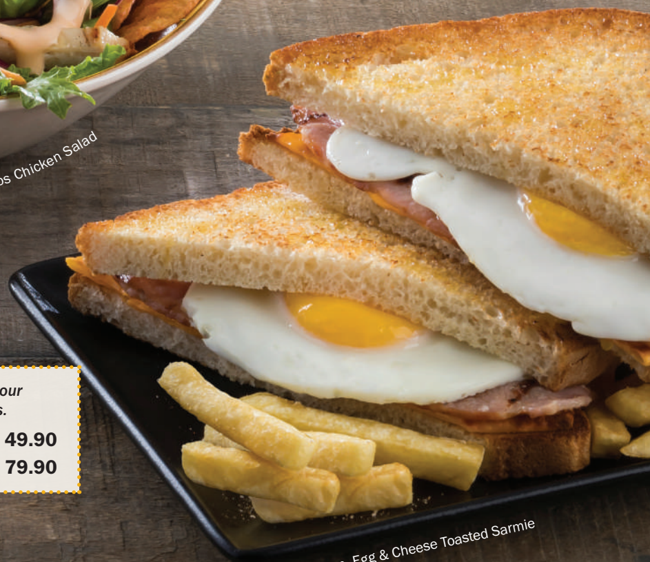
Bacon, Egg & Cheese Toasted Sarmie