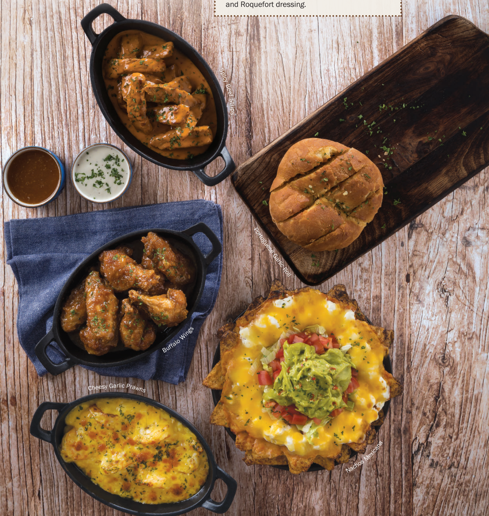
Spicy Beef Strips