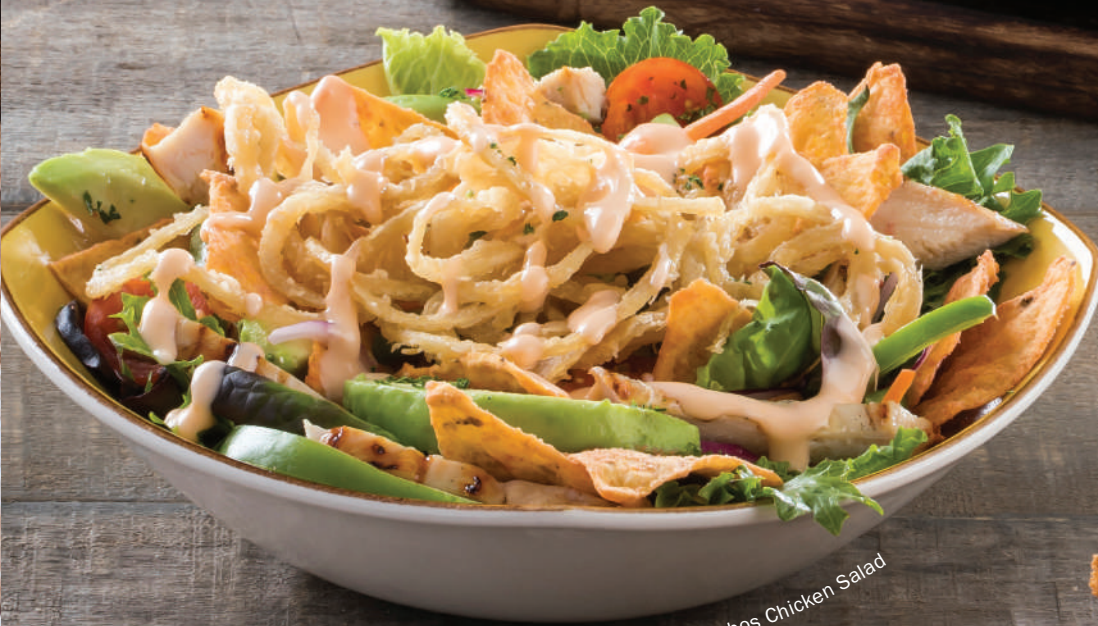
Nachos Chicken Salad