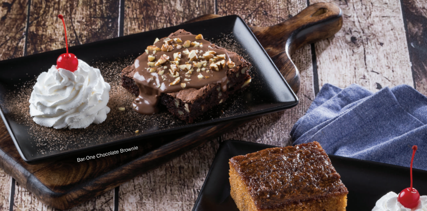
Bar-One Chocolate Brownie

! ALLERGENS: Our desserts are made in-house and may contain nuts.