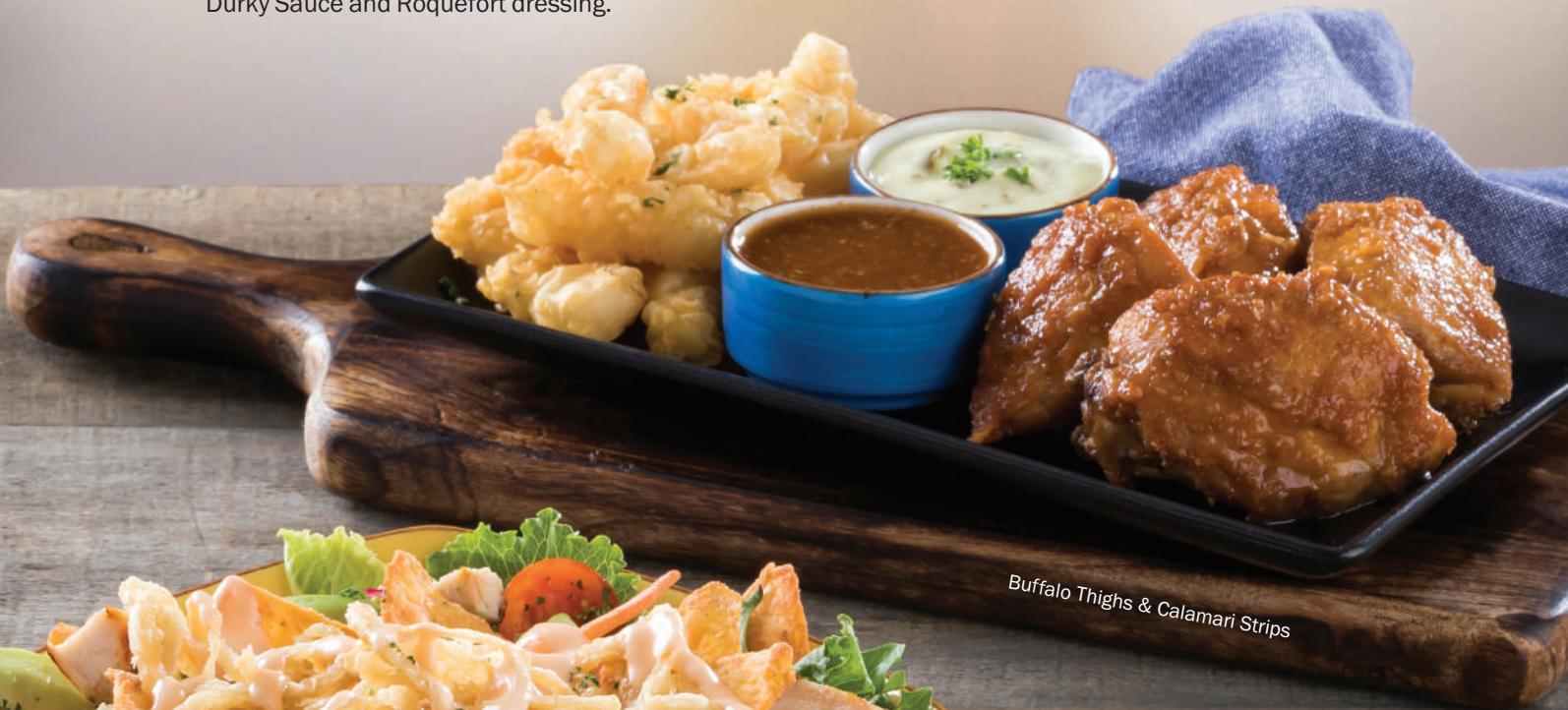
Buffalo Thighs & Calamari Strips

Ask about the available selection of hot veg.